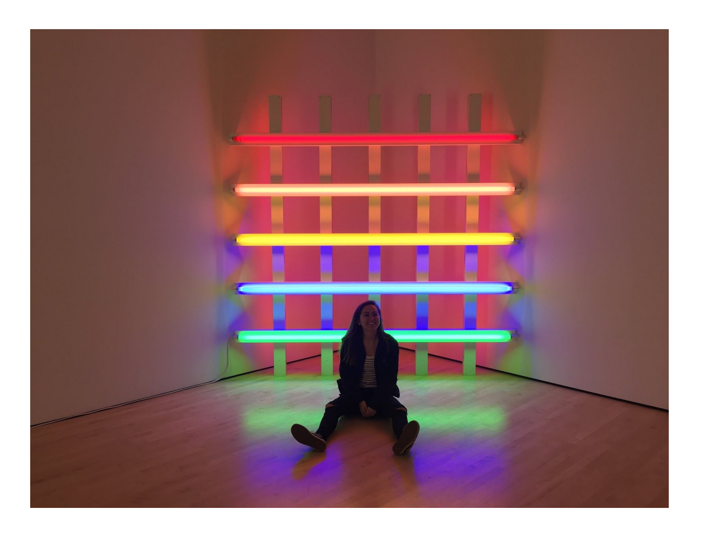
Acceptance. Labels are there to help others find comfort in your identity.