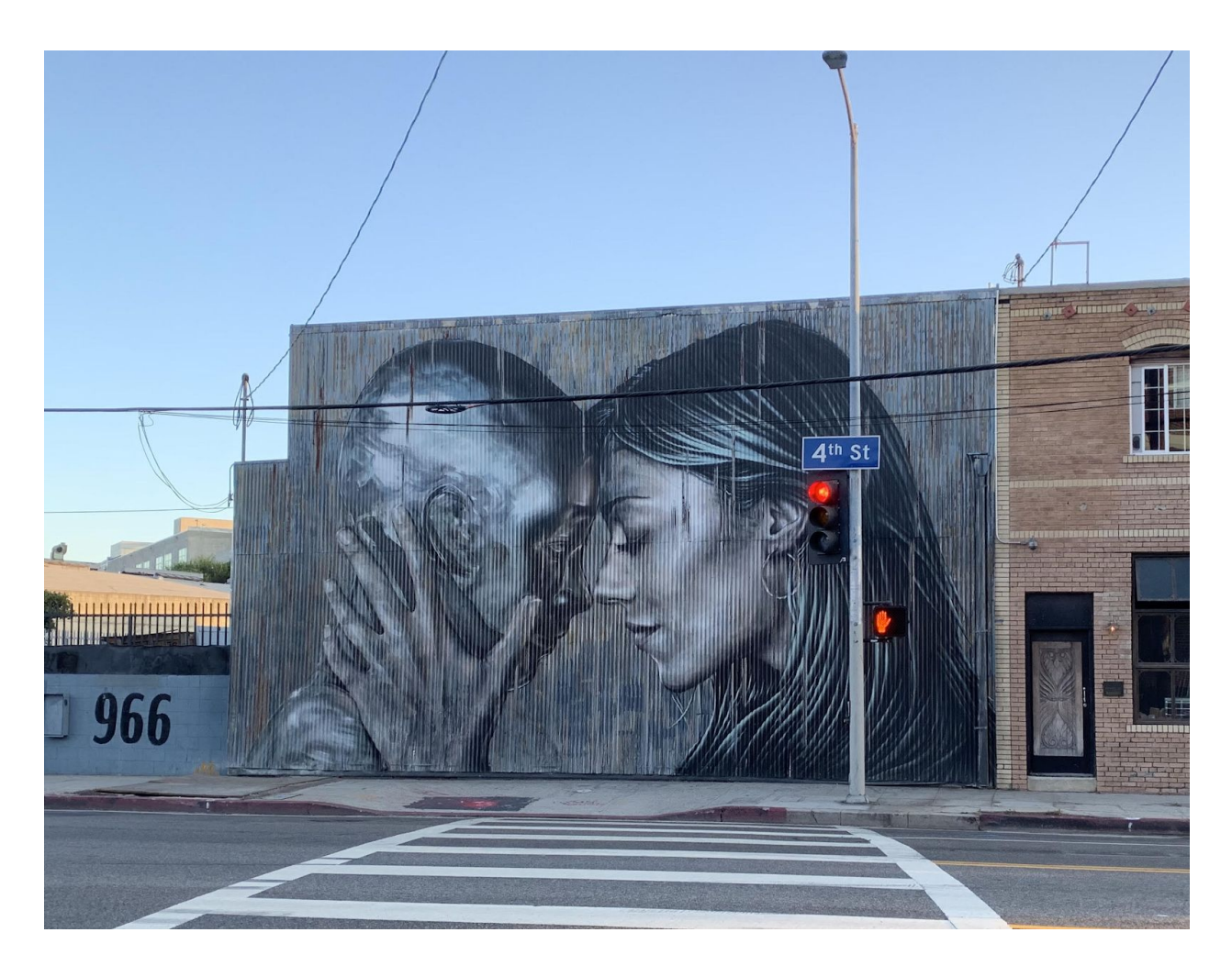
Love. Love is love. Love is art. Representation matters.