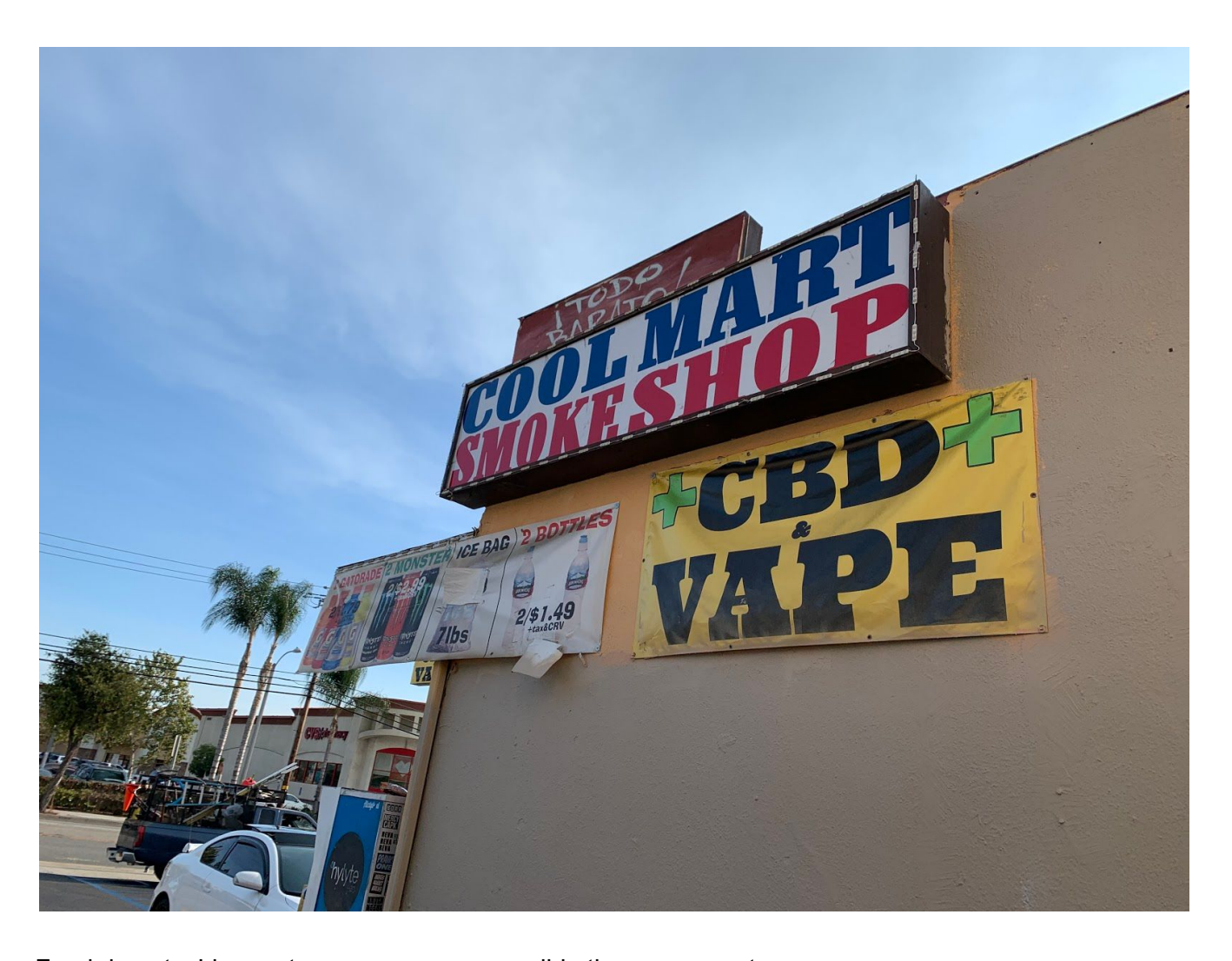
Food deserts. Liquor stores are more accessible than grocery stores.