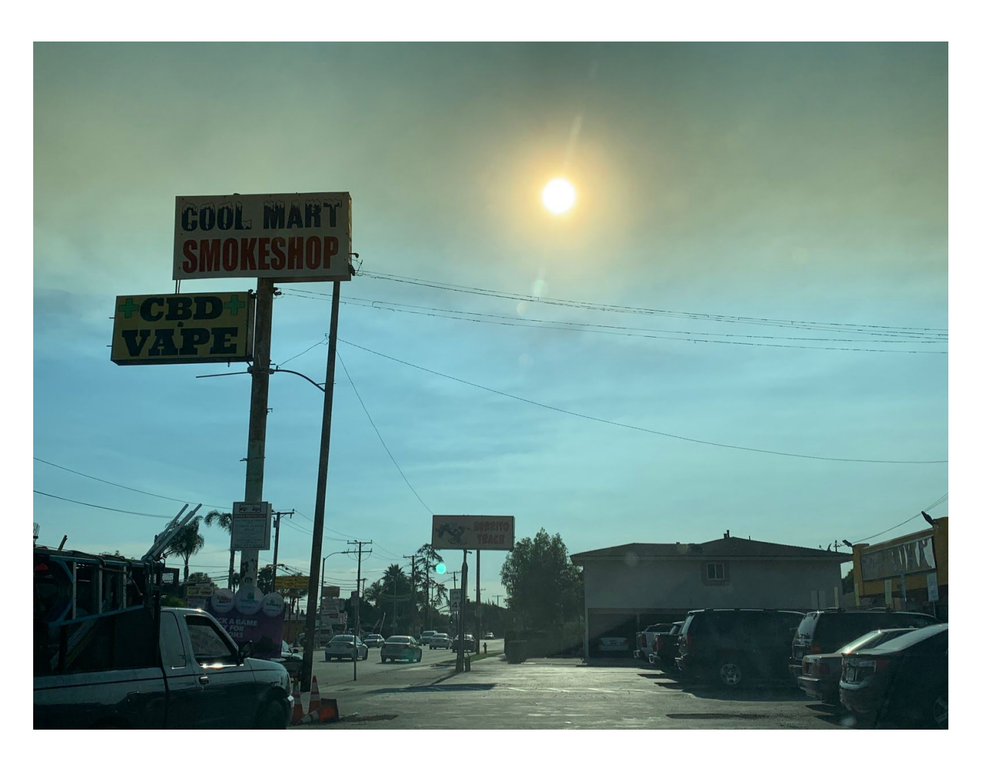
Pollution. Urban cities often have high levels of pollution. Kids are most susceptible and often develop asthma.