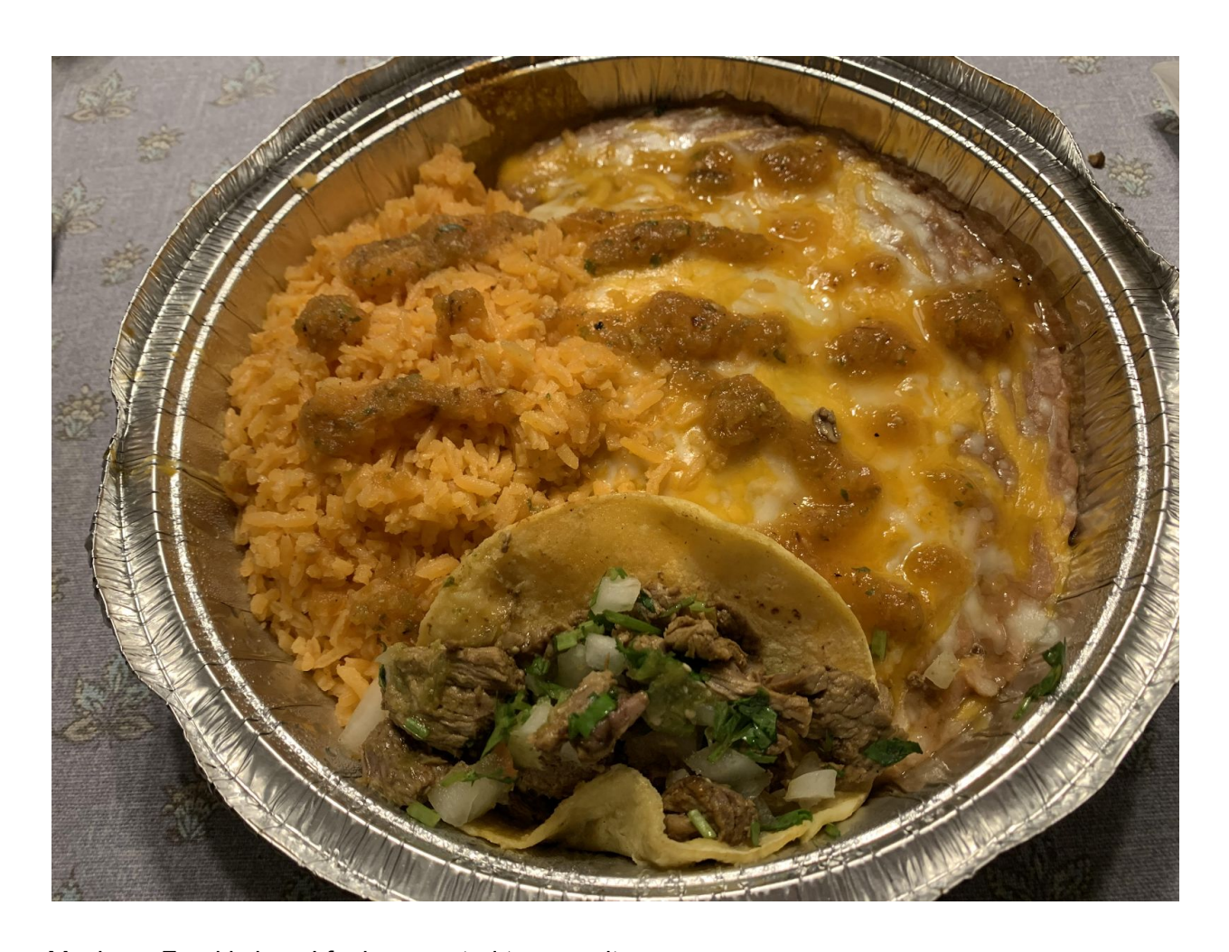
Mexican. Food is how I feel connected to my culture.