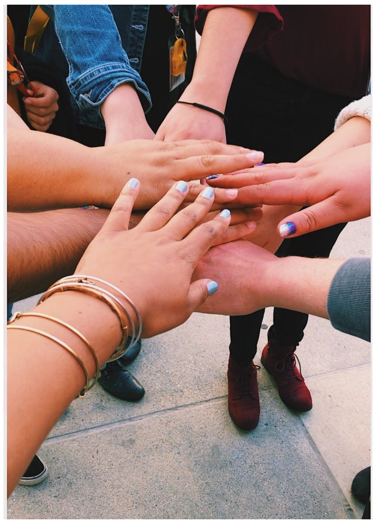
Goals. Diversity, Inclusivity, Acceptance, Belonging.