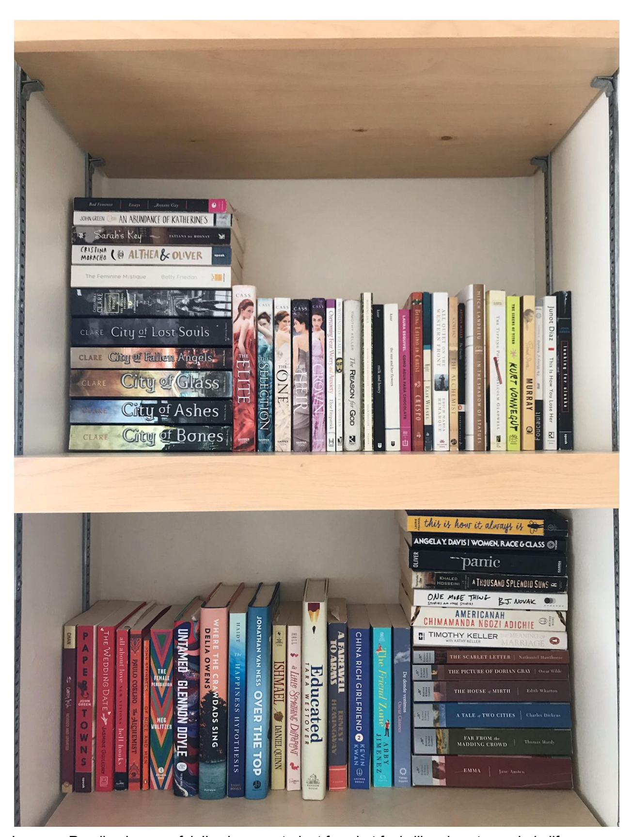
Learner. Reading is powerful. I've been a student for what feels like almost my whole life.