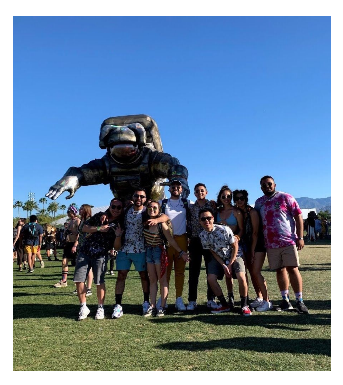
Friend. Friends are the family you choose.