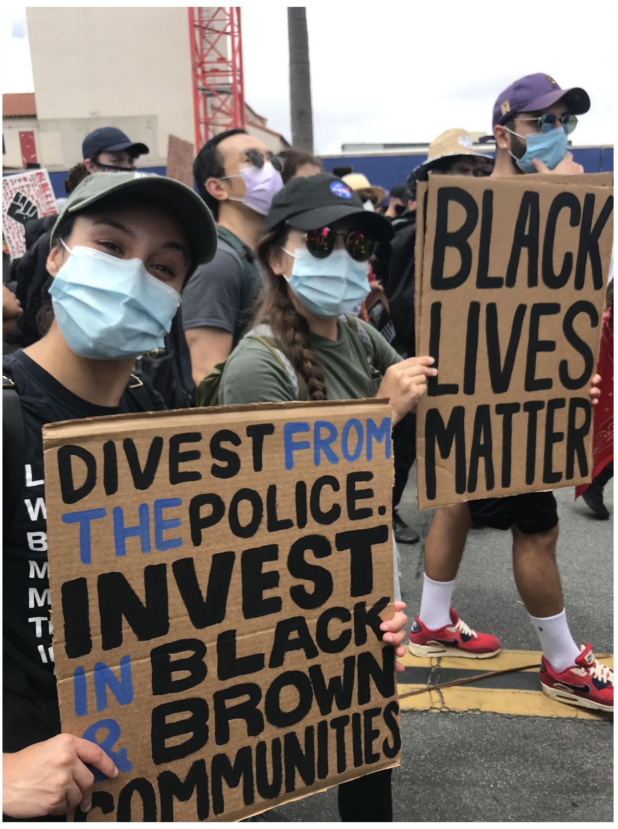
Advocate. Use your privilege. Advocacy and social justice is how you bring about change.