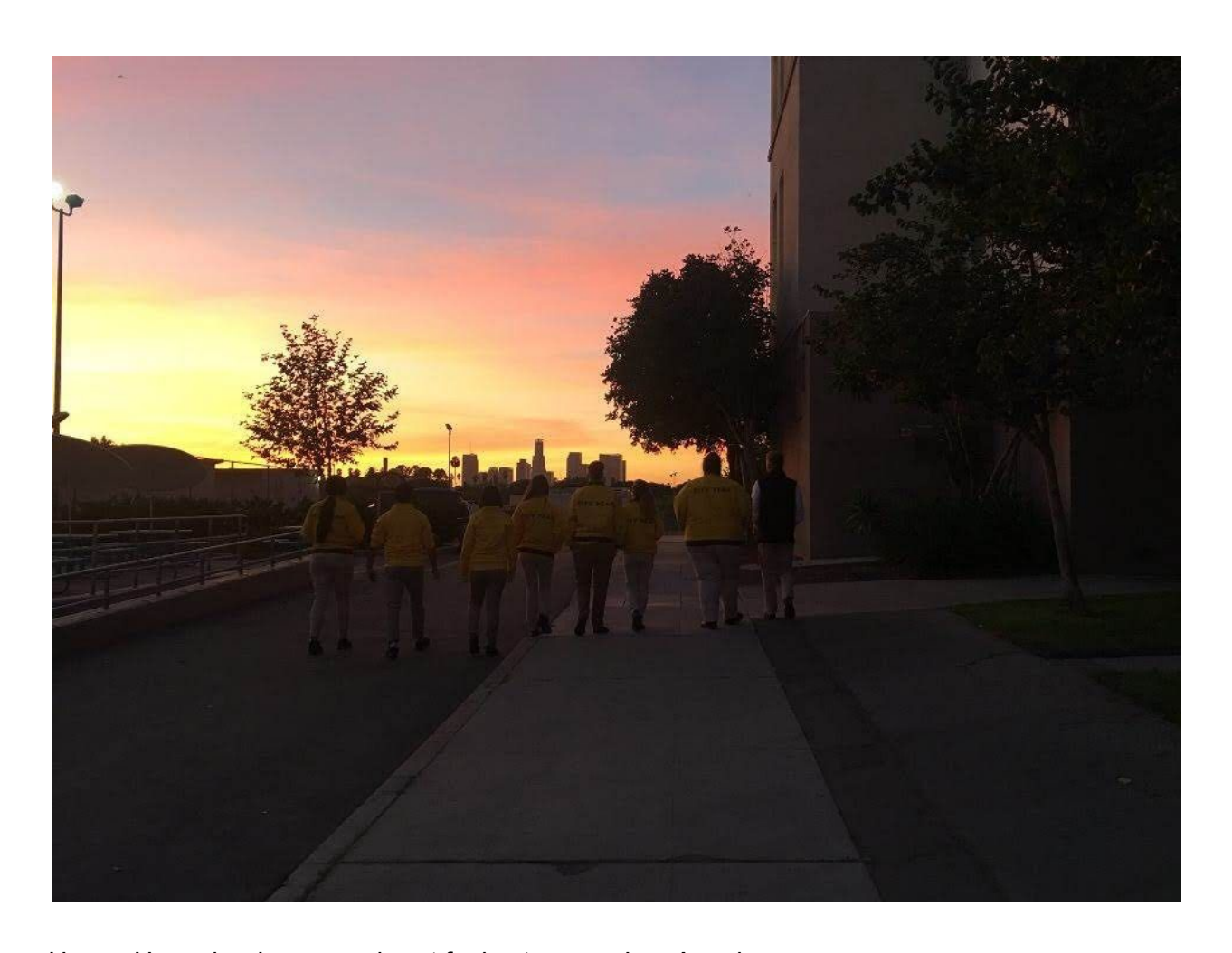
Home. Home is where your heart feels at peace. Los Angeles.