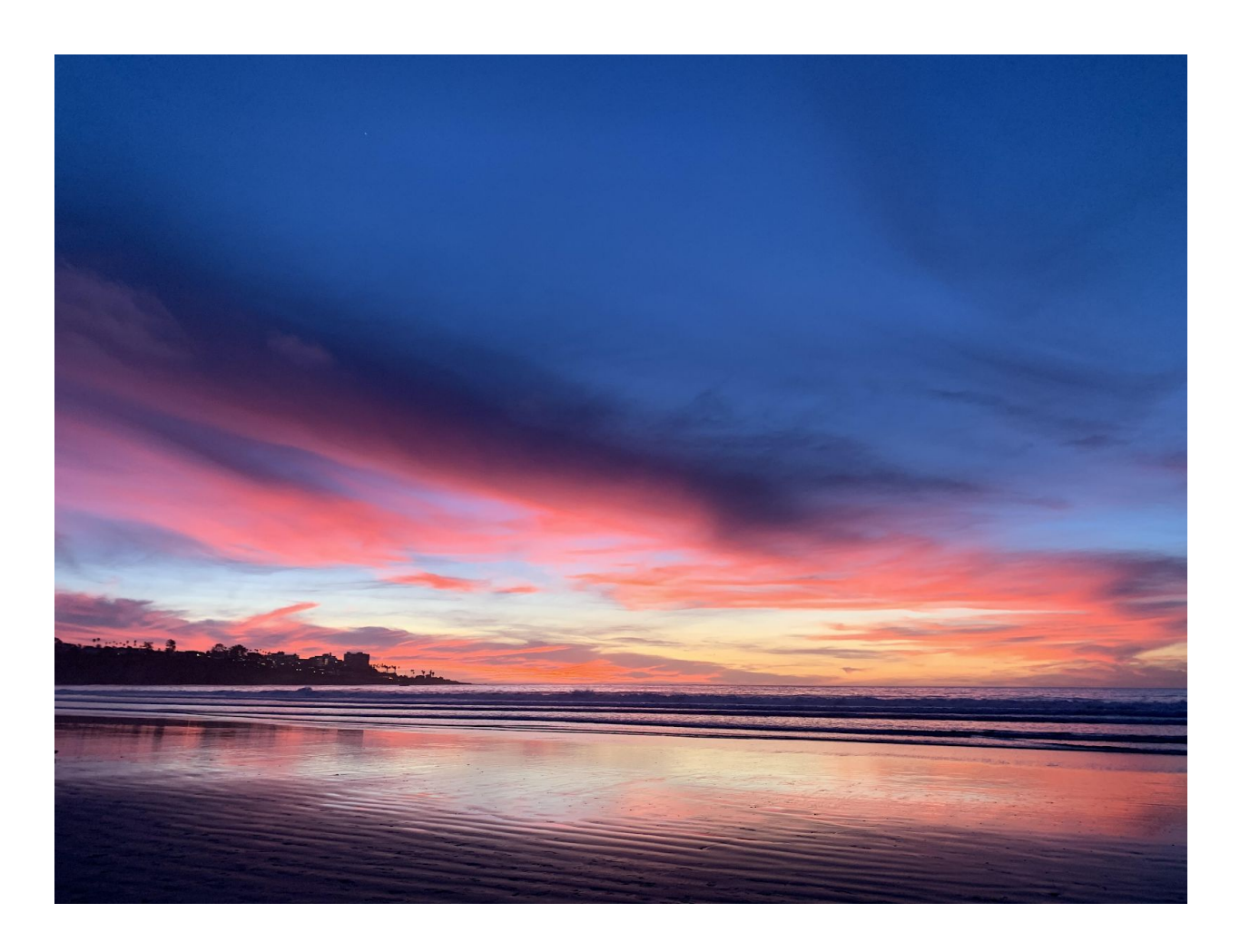
Home. Home is where your heart feels at peace. San Diego.