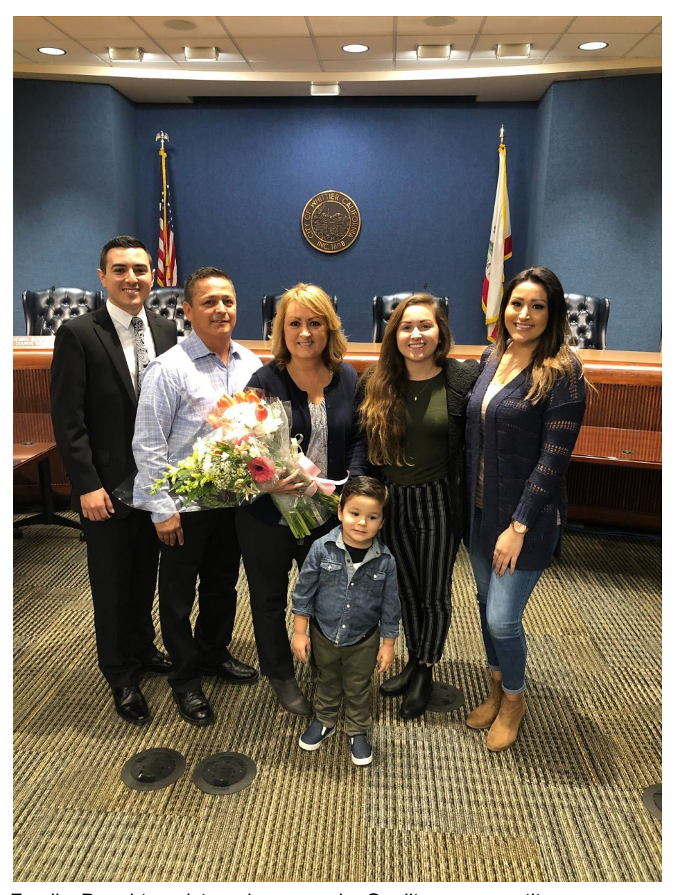
Family. Daughter, sister, niece, cousin. Quality over quantity.