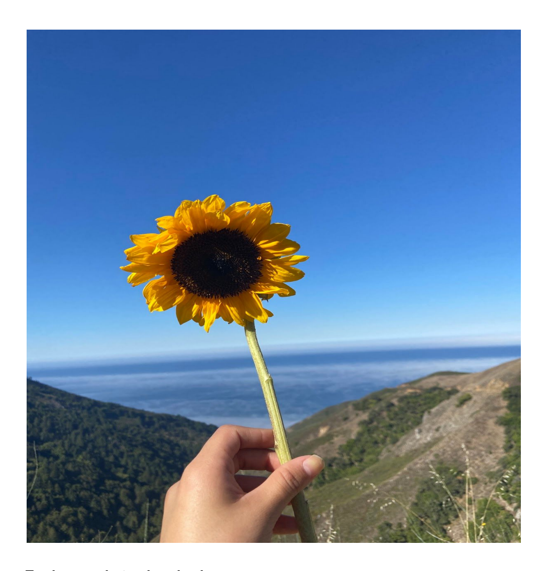
Explore and stay inspired.