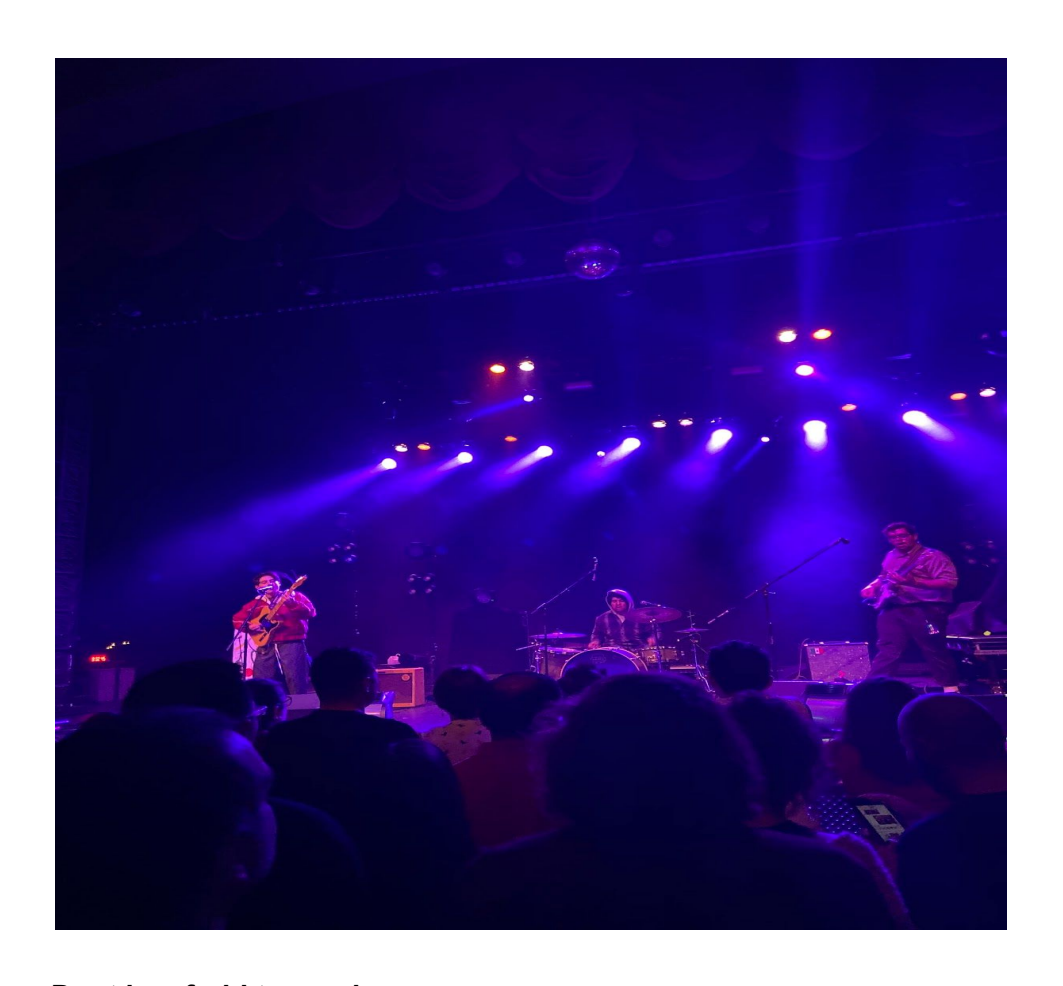
Dont be afraid to go alone.