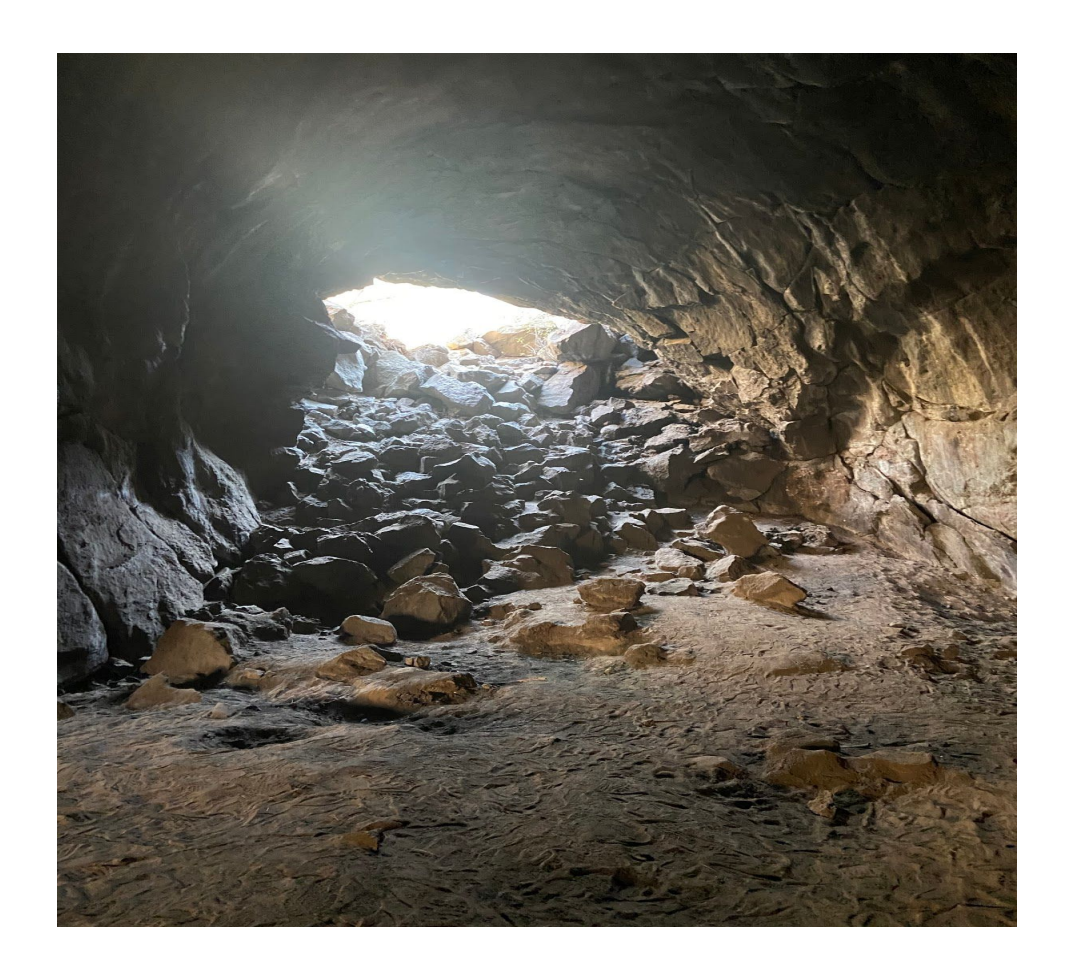
There is light at the end of the tunnel.