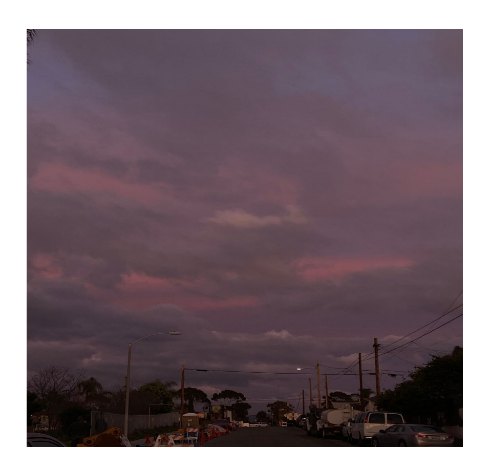
It gets better.