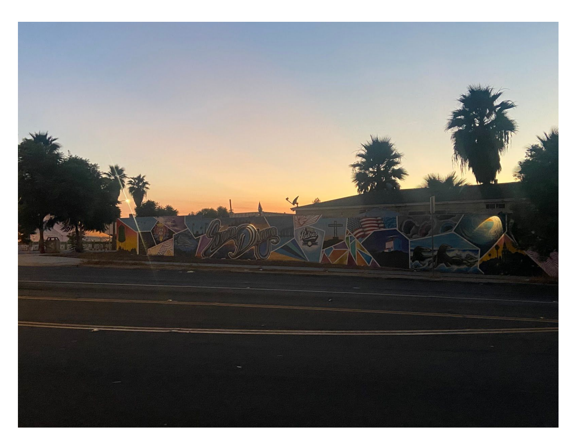
We are San Diego.