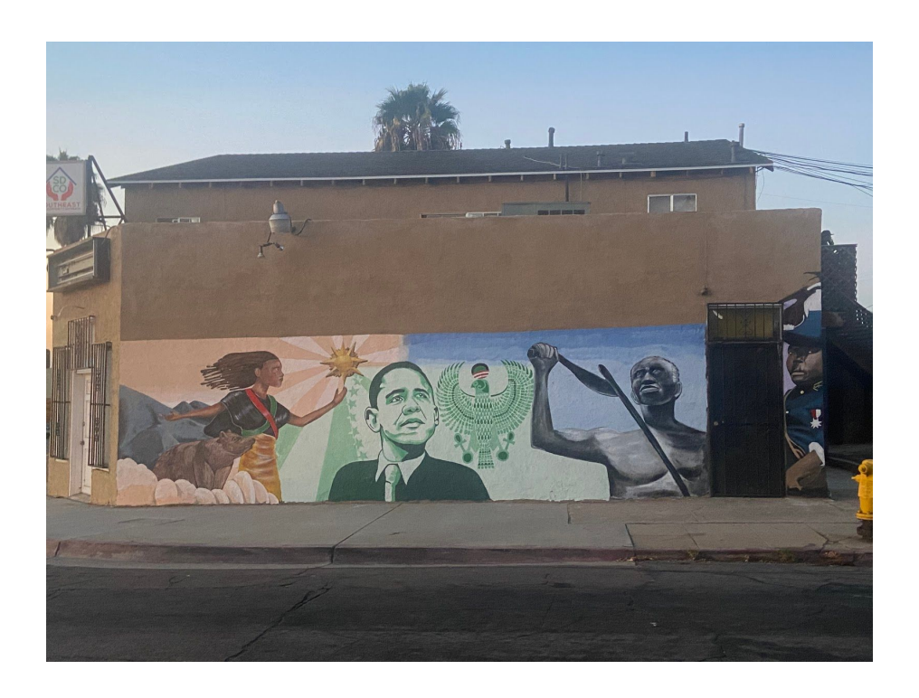
The art is our culture.